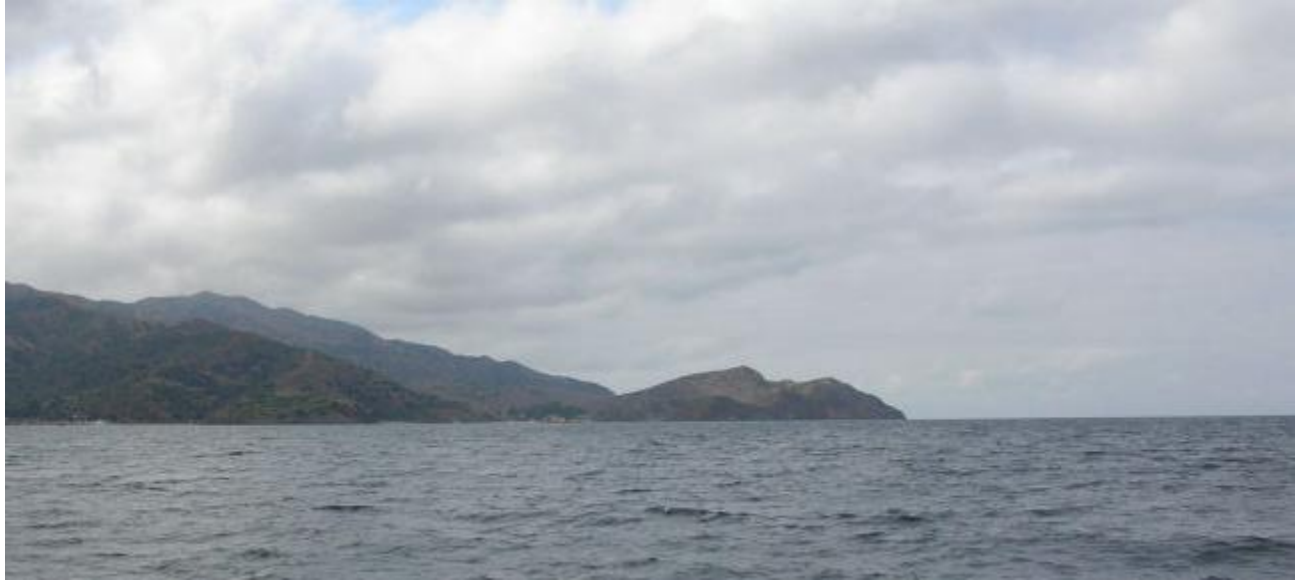
Island getting close now. Here's a shot looking toward the west end, from about 2 miles away.