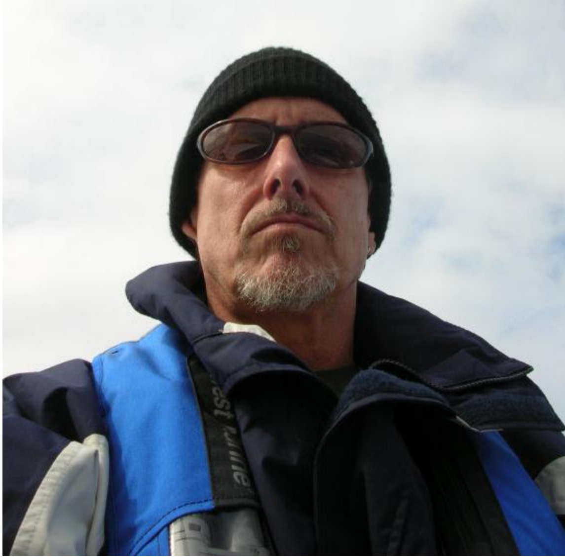
Self-portrait. 😊 When I single hand, I'm always wearing a PFD with harness, and always clipped in to jacklines running the full length of the deck.