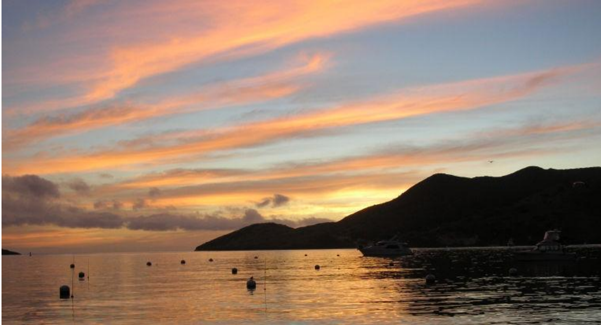
Next morning, sunrise.