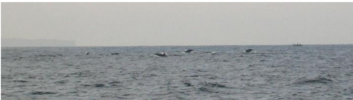
I had a nice long encounter with an enormous pod of dolphins heading north. That's Palos Verdes Peninsula in the distance.