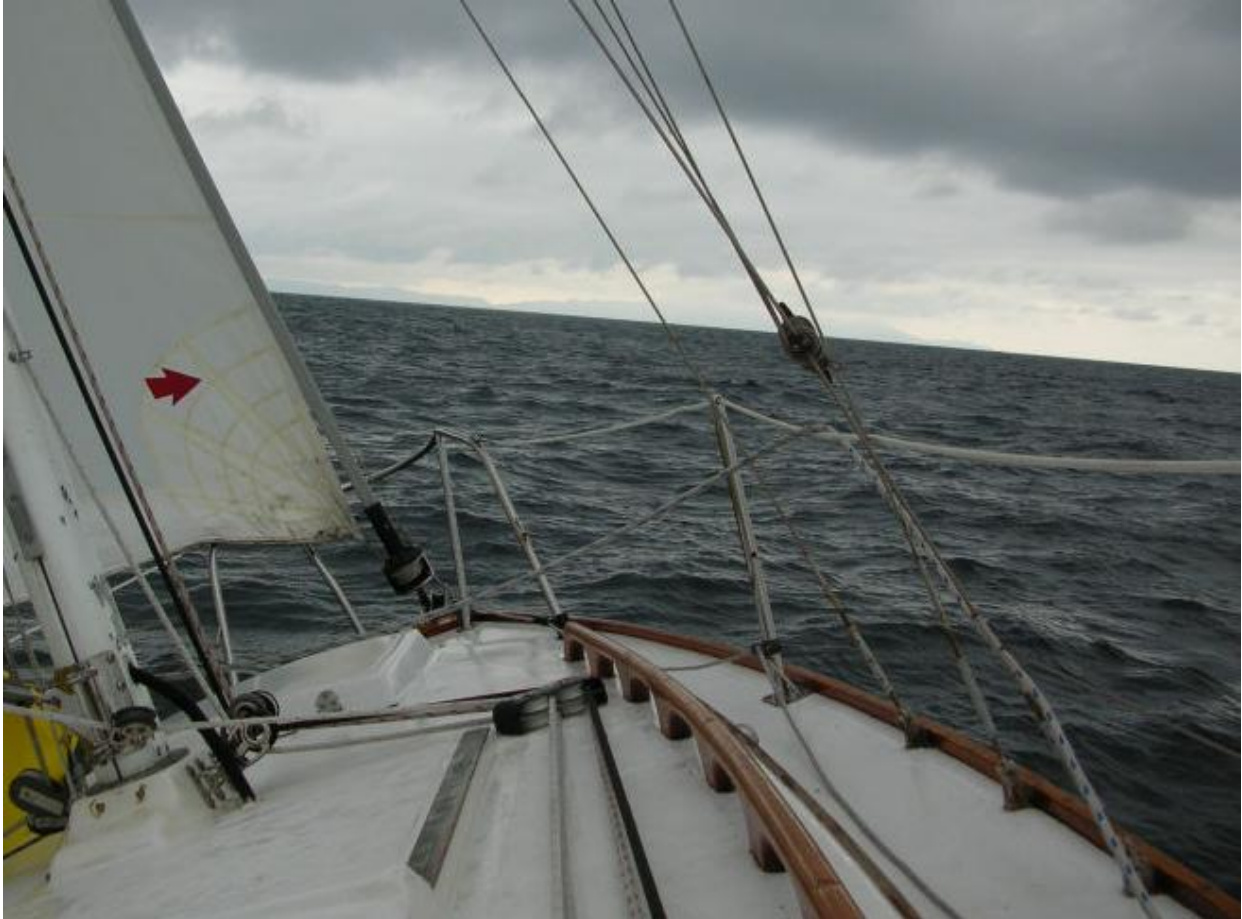
Here we are about 1/3 of the way across the channel. Rain threatened but never materialized. About 10 knots breeze now.