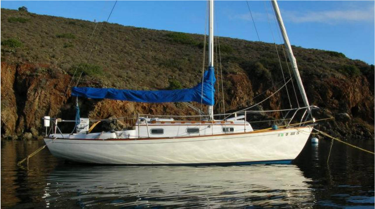
A couple of shots of Robin Lee at mooring, from my kayak: