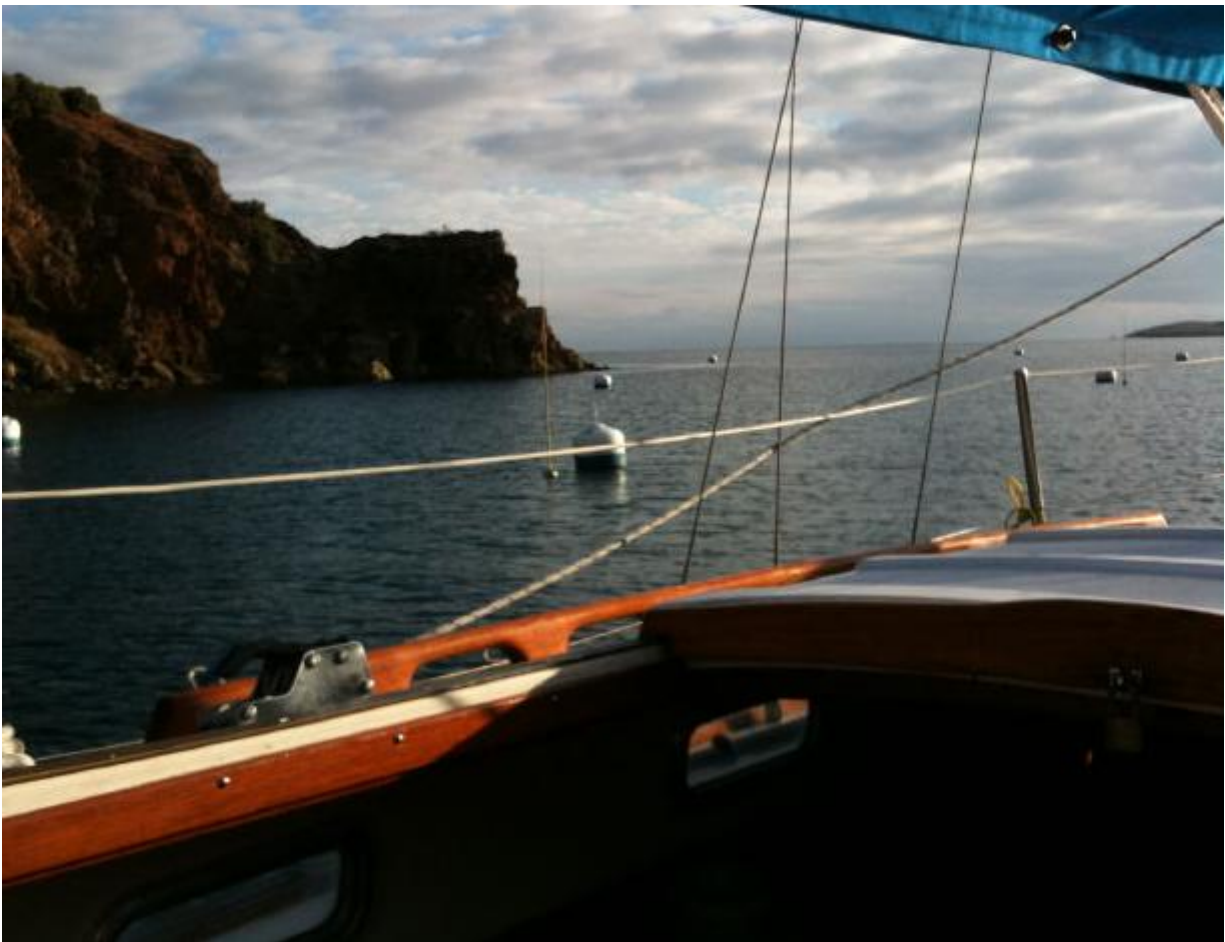
And, finally, at mooring... cocktail hour. Passage took 5-1/2 hours. Not bad.