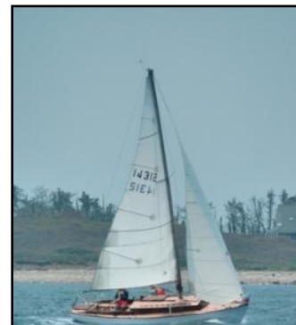
Left: Marionette at Payne's Dock, Great Salt Pond, Block Island, flying her battle flag; Center: A favorite position - leading bigger boats to the mark (note reefed main): Right: in close to shore, moving fast